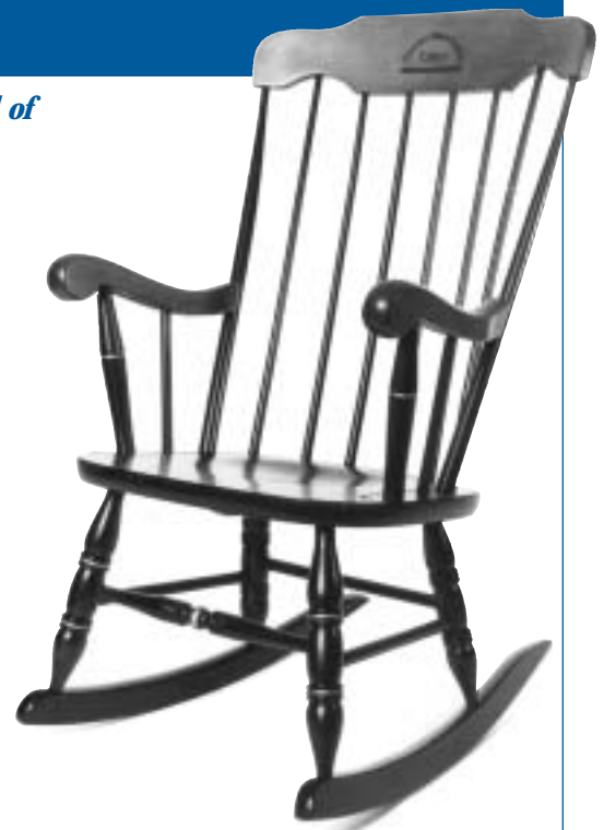
Boston Rocker Black, solid maple hardwood Boston rocker